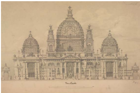
Otto Wagner (1841–1918)

Front elevation of the main façade of Berlin Dome, 1891