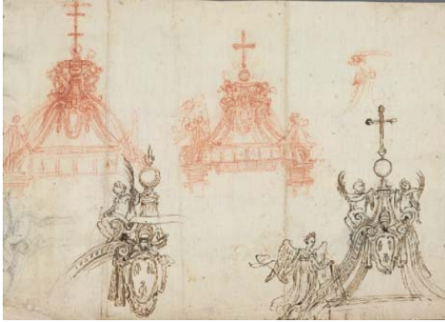
Gian Lorenzo Bernini (1598–1680)

Studies for the crown of St. Peter's Baldachin in Rome, 1631